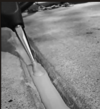
KwiXseal™ Rubber is Applied Hot