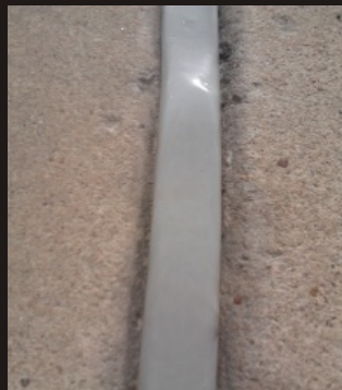
Traffic Ready in Minutes