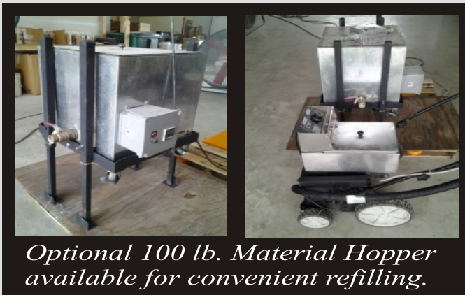
Optional 100 lb. Material Hopper available for convenient refilling.

For use on driveways, sidewalks, shopping centers, office buildings & more!