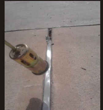
Simply Re-heat to Repair any areas

KwiXseal™ offers a custom-fit, immediate use, long lasting & durable expansion joint.