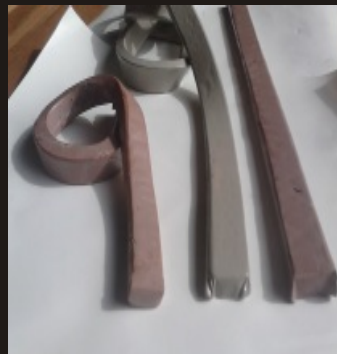
Custom Colors Available